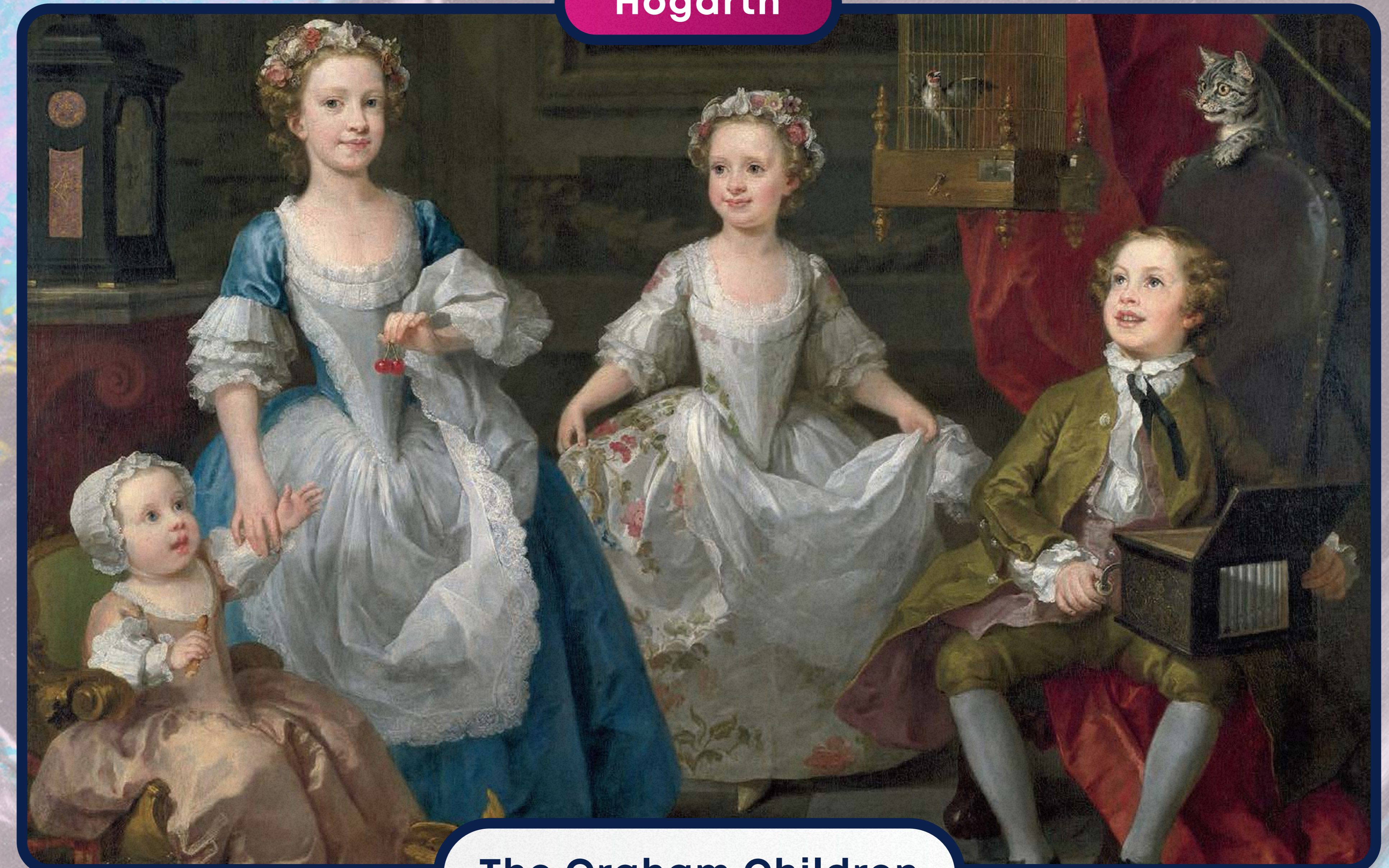
The Graham Children